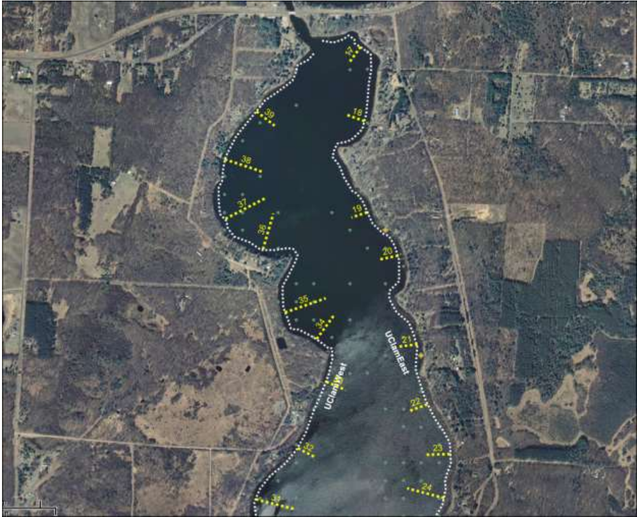
Figure 3: North end of Upper Clam Lake