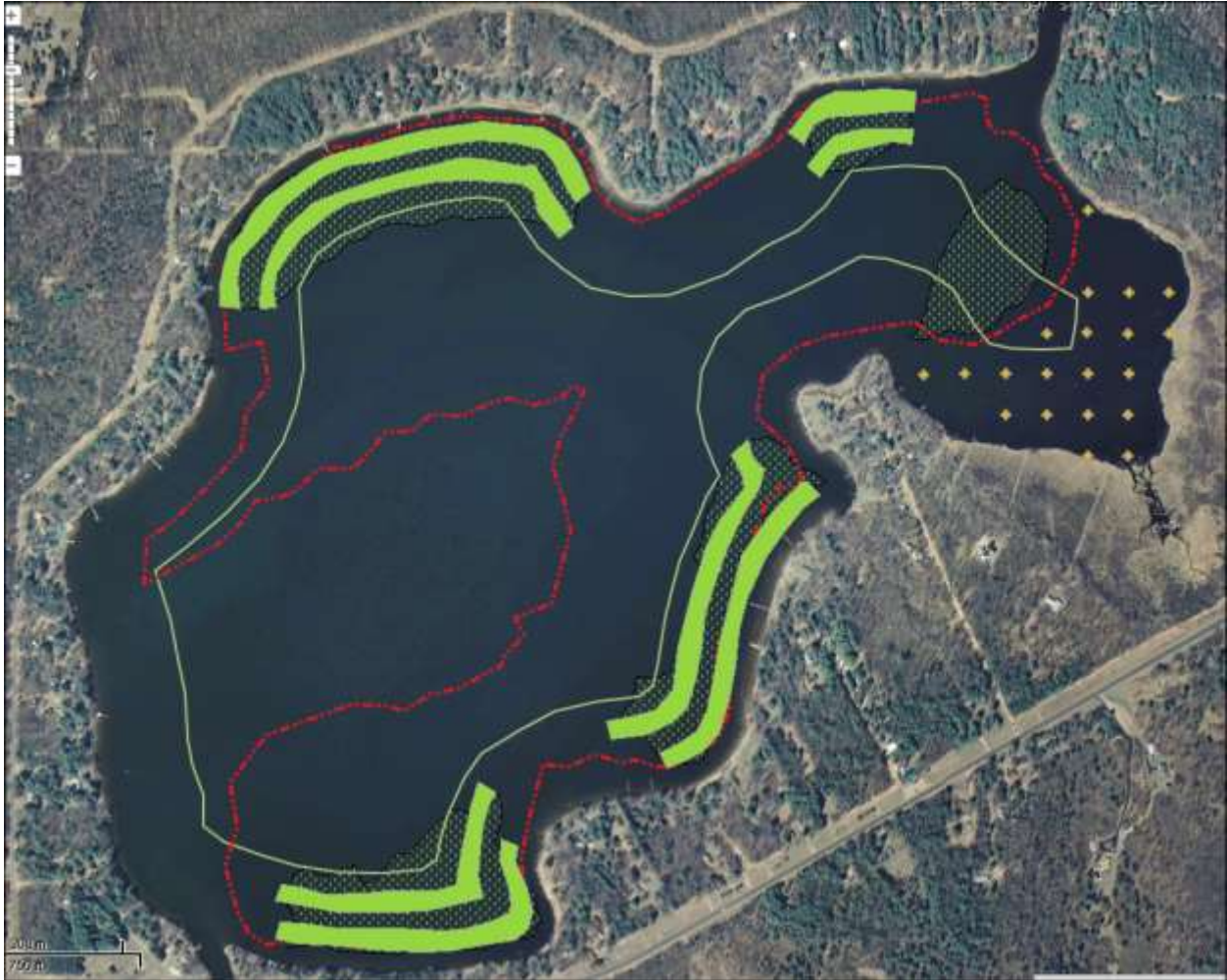
Figure 1: Light green polygons = bed harvesting lanes; Light green line = 500-ft from shore; Green checked polygons = 2019 CLP beds; Orange crosses = 2019 wild rice; Red dashed line = outline of 2009 CLP bed.