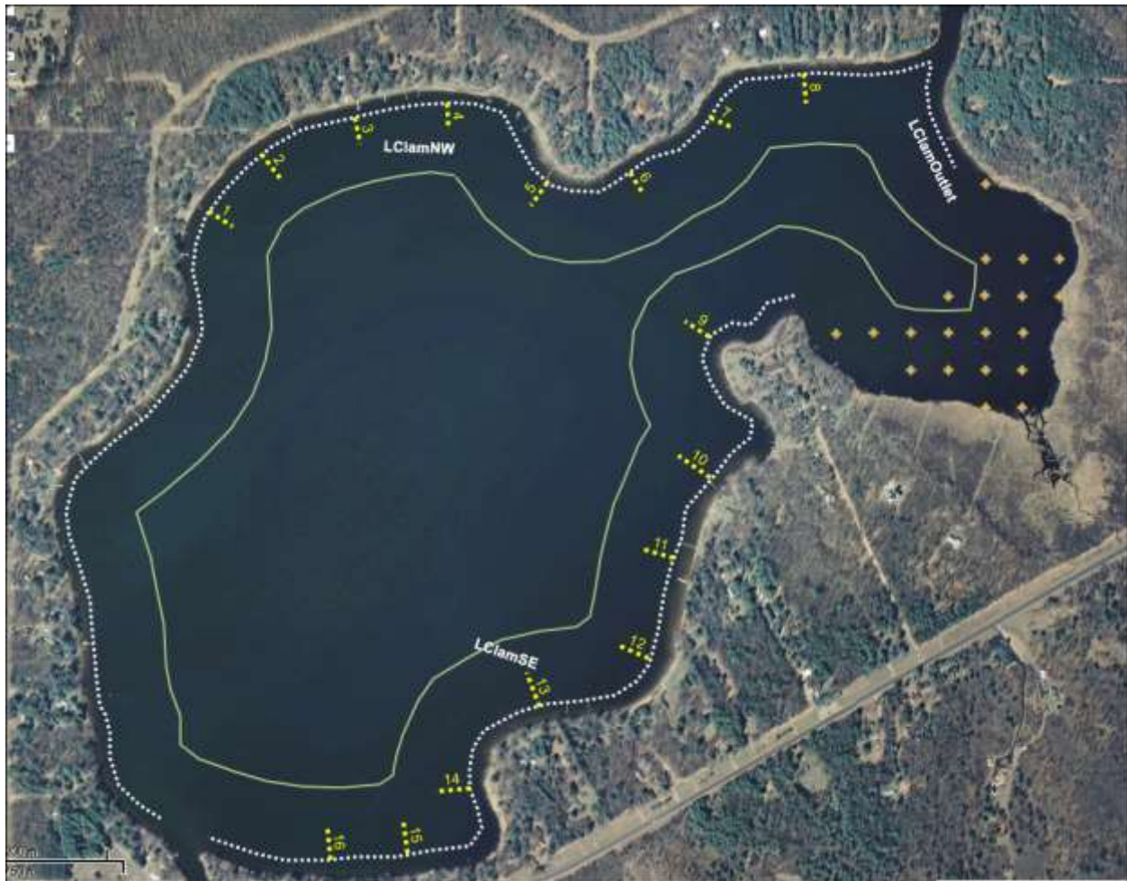
Figure 2: White dotted line = navigation channel parallel to shore 75-ft wide; Yellow dotted lines = Open water access lanes; Light green line = 500-ft from shore; Orange crosses = wild rice